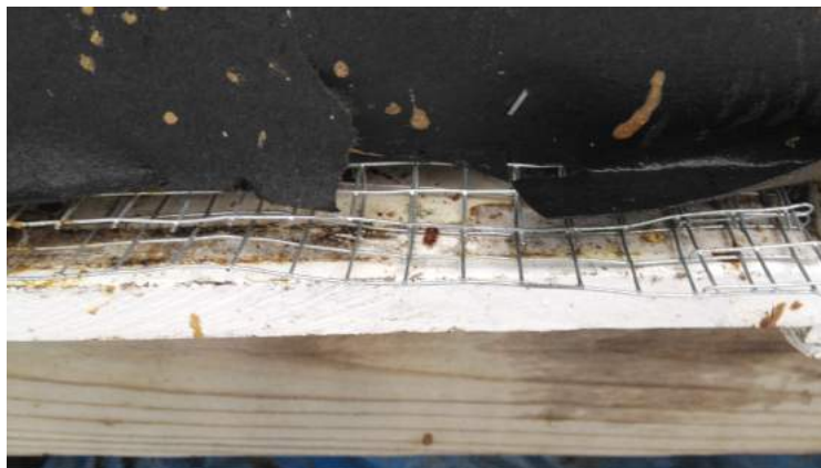
Figure 5. Lower hive entrance with mouse guard in place. Note the bee fecal deposits on the tar paper over the entrance.

Animal damage and vandalism are problems that you should be aware may exist and you should protect your hives. In the fall, mice start looking for nice warm places to spend the winter. They are able to crawl in through your lower hive entrances when the bees begin to cluster and are not “at the door” to drive away intruders. To prevent mice from destroying frames in your hives and eating your clustering bees, place mouse guards in your lower entrances. There are nice ones available commercially, or you can make your own very easily using hardware cloth. Cut it to fit the width of the hive entrance, and ensure that it is at least three times the height of the entrance. Fold it in half and push it into the entrance (Figure 5). Elevating your hives using a hive stand is also helpful (see Figure 4).